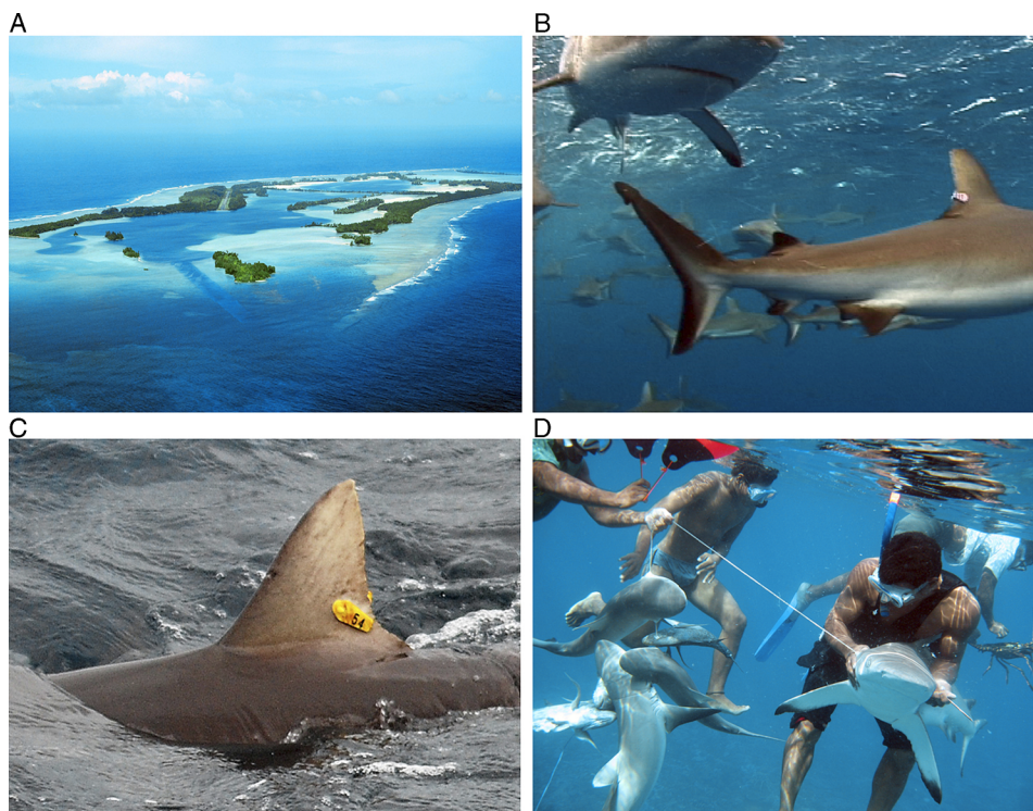
FIG. 3. (A) With one of the world's highest densities of coastal sharks, Palmyra Atoll provided an ideal environment to compare the performance of shark surveys with statistical rigor. (B, C) Mark and recapture surveys of gray reef sharks Carcharhinus amblyrhynchos provide population size estimates that complement density estimates yielded from underwater surveys. (D) Shark harvesting at neighboring Tabuaeran Atoll and elsewhere in the tropical Pacific has severely reduced reef shark populations. Understanding and managing these declines requires having an adequate understanding of the accuracy of shark survey methods.

Some species of sharks are thought to become more active with the onset of nightfall raising concern about how well density estimates calculated during the day approximate overall shark densities in a habitat. We, however, found no differences between density estimates made during daytime and evening periods in our video surveys. This finding provides preliminary support for the conclusion that our outputs from diurnal surveys can serve as good overall proxies for shark density at this location.